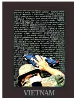
REMEMBER THE FALLEN